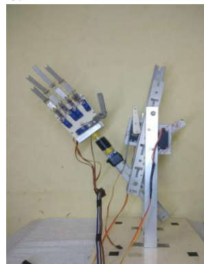
Fig 3. Robotic Arm

Rotational motion of the Servo motor using the microcontroller output data. The signals are carried out through connecting wire as it act as a wired system. The servo motor mechanism is so simple thus reliability can be obtained. The heart of a servo is a small Direct Current (DC) motor. This high torque operation can also be obtained using geared motor but the servo motor is more reliable and perfectly suitable. Servo motor is connected with Arduino Nano atmega 328P microcontroller through communication lines as follows the yellow wire is signal wire which is interfaced with Arduino Nano's digital pin , The red wire is positive wire which is interfaced with 5V pin, the black wire is negative wire and it is interfaced with ground. After the code is uploaded as per the requirement to the Nano. Then the servo motor will follow the commands given by Nano.