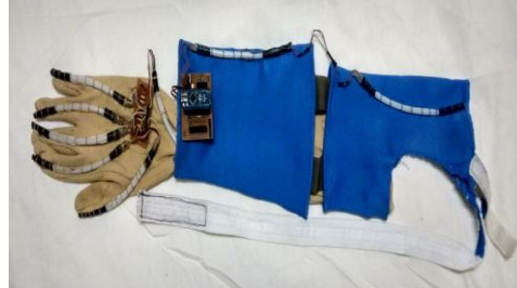
Fig 2. Flex sensor placed hand glove

Optical Flexible sensor [6] which consist of Light Emitting Diode (LED) at one end and Light Dependent Resistor (LDR) on the other end .Thus it is covered by opaque tube and it is powered using (9V) battery source or through the Universal Serial Bus (USB) because the Arduino Nano microcontroller consist of USB port during uploading the code using Arduino software. We had decided to use eight flex sensor for sensing every part of human hand.